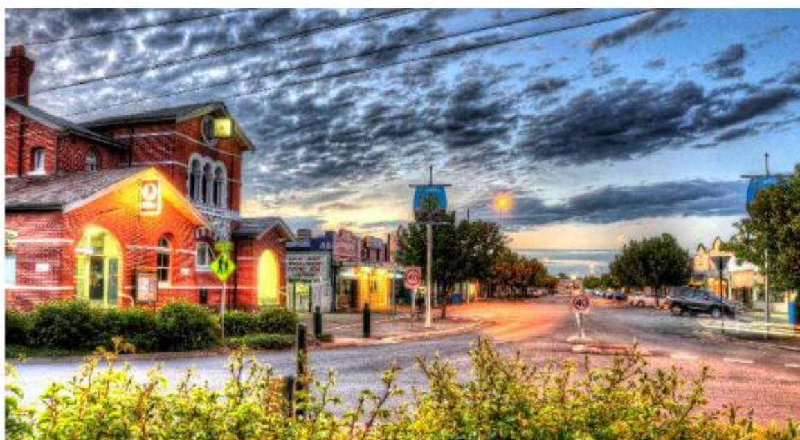
(Binney Street, Euroa)