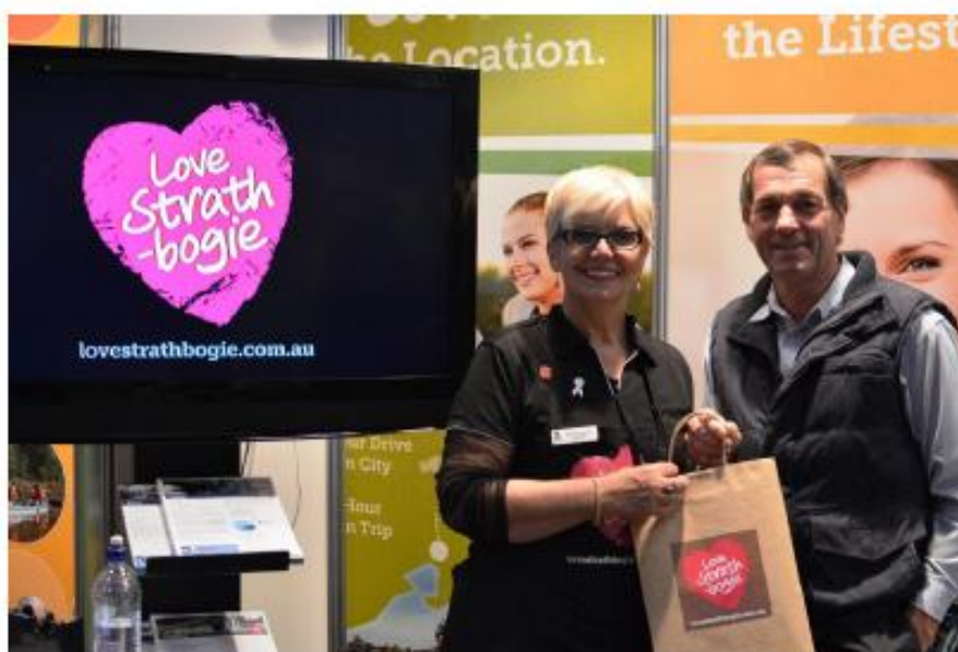
(Regional Living Expo 2013)