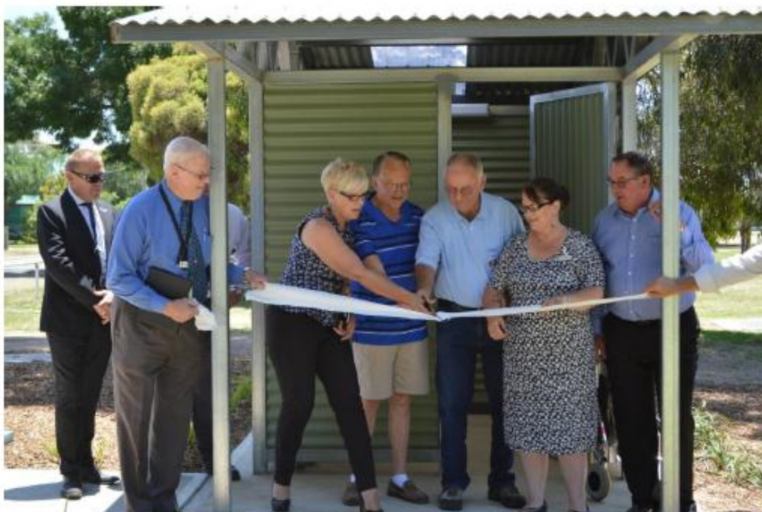
(Lions Club Toilet Block Opening)