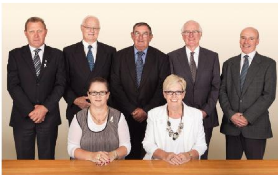
(Strathbogie Shire Councillors)