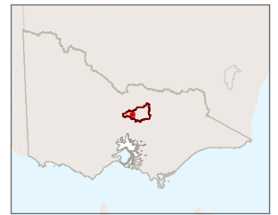
Part of Planning Scheme Map 22

Disclaimer This publication may be of assistance to you but the State of Victoria and its employees do not guarantee that the publication is without flaw of any kind or is wholly appropriate for your particular purposes and therefore disclaims all liability for any error, loss or other consequence which may arise from you relying on any information in this publication.