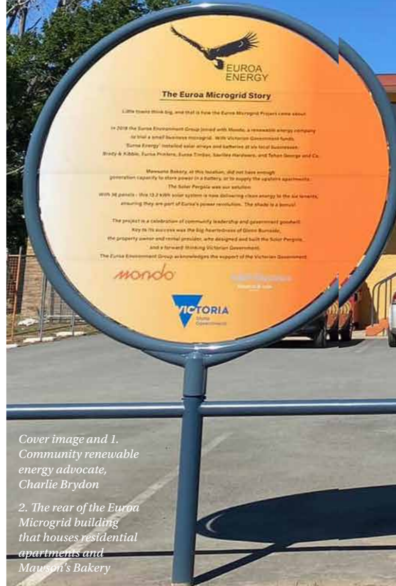
Cover image and 1. Community renewable energy advocate, Charlie Brydon