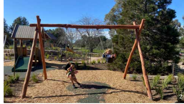
Nature Based Play Space