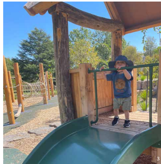
Cover image. Wangaratta Children's Garden

Further to this, delivery of this project would support local jobs and provide equitable playground facilities to neighbouring regions and metropolitan councils.