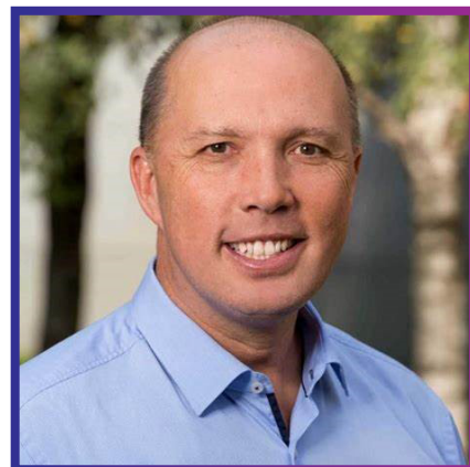
THE HON PETER DUTTON MP (INVITED)