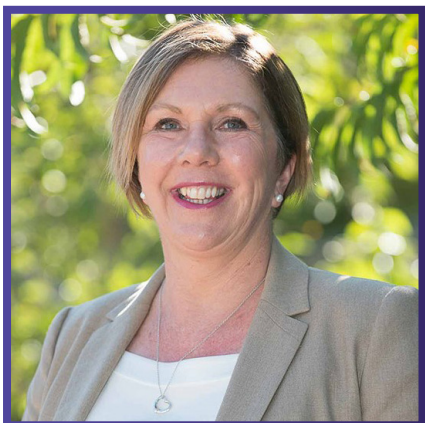
THE HON CATHERINE KING MP (INVITED)

Minister for Infrastructure, Transport, Regional Development and Local Government