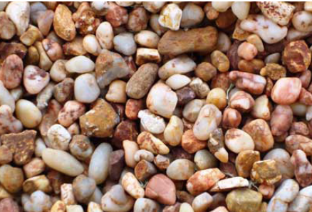
Type 1: Existing pebble