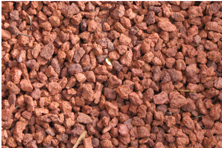
Type 2: Secondary pebble (red).