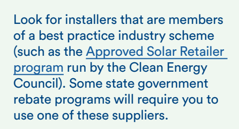
Ask installers about how many systems they have installed, and if you can speak to other customers of theirs about their experience.

Find other people with off-grid systems and ask them about their experiences with off-grid system designers and installers.