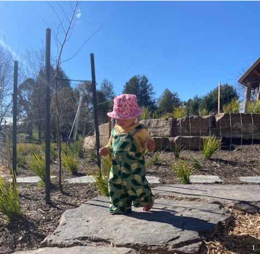
1. Mansfield Botanic Park Playground

We have observed visitors to the township pull-up at the current playgrounds which are restrictive in age, size and sensory applications, and our community wants us to address this.”