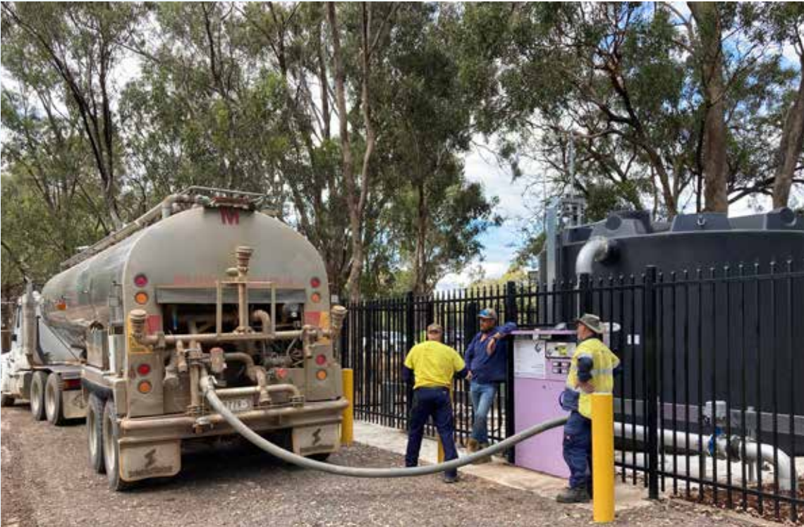
Cover image. Friendlies Oval, Euroa, one of the sites to benefit from this project

The Greening Euroa project is climate smart, cost efficient and community inspired. It demonstrates a smart use of a valuable resource while taking pressure off our potable water supply and our waterways heavily relied upon by farm dams and groundwater bores.