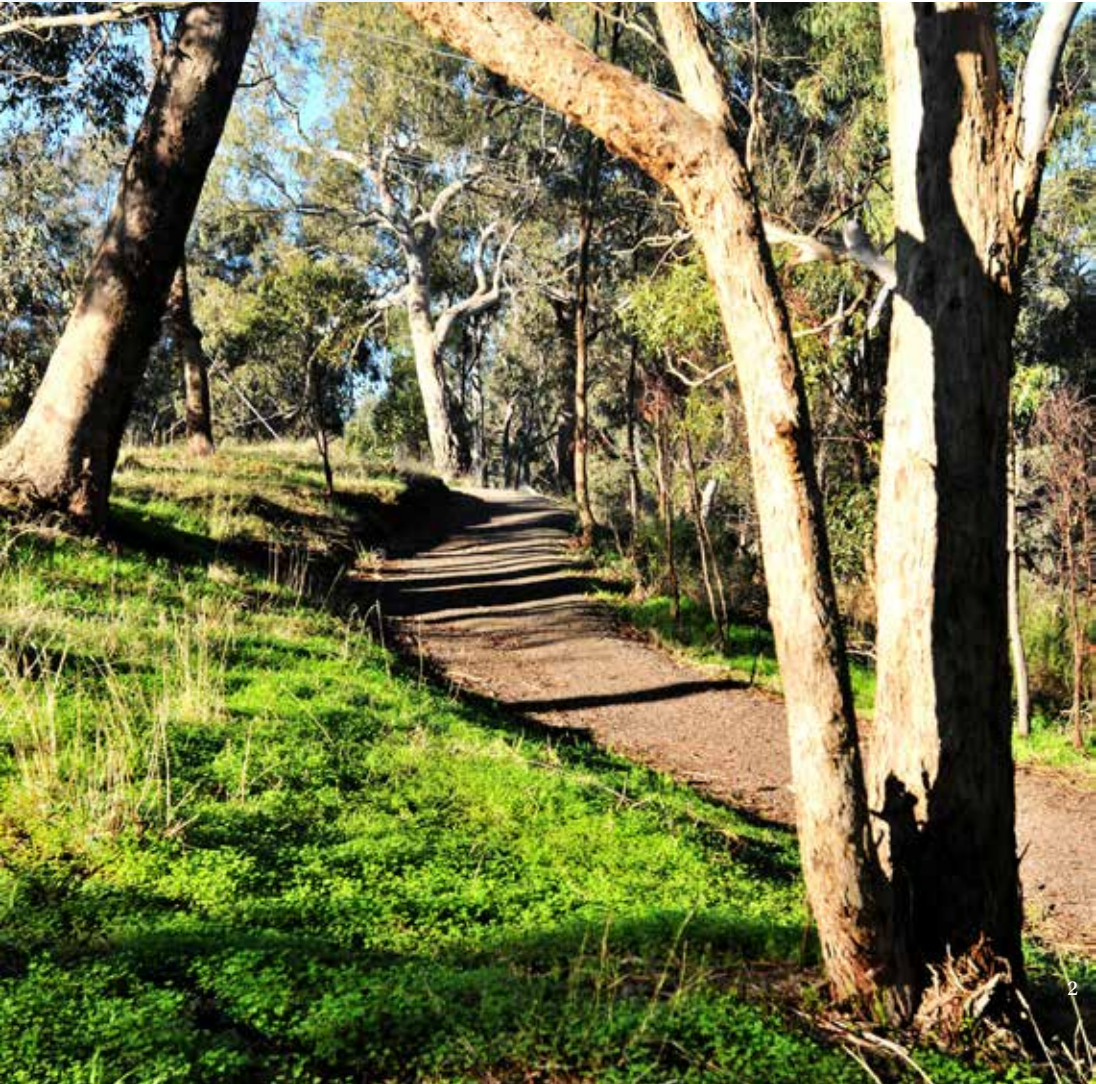
Cover image, 1, 3 and 4. Mountain bike riding (location indicative only) 2. Environment along the Sevens Creek, at the foot of Balmattum Hill

Preliminary advice tells us the site is highly suitable for all abilities, including universally accessible trails.