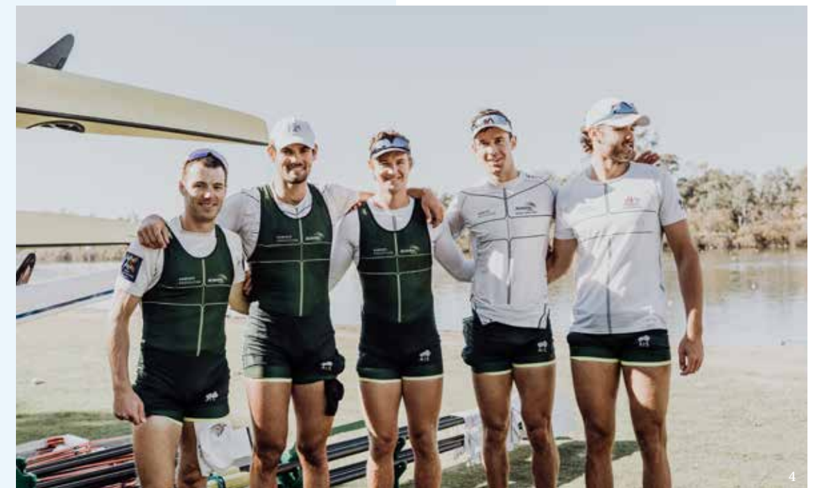
4. Australian Olympic Rowing team training at Nagambie Lakes Regatta Centre in 2021.