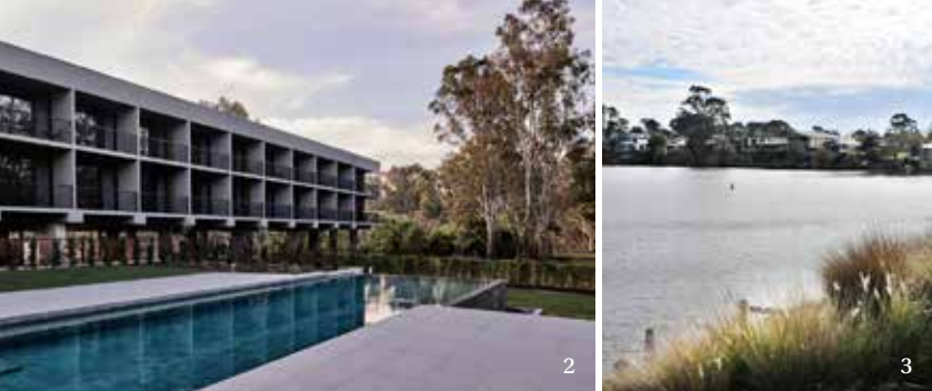
2026 Commonwealth Games: Lake Nagambie venue bid

Lake Nagambie’s blue water, rich natural surroundings and rural setting is an optimal location to hold the 2026 Commonwealth Games Rowing events.