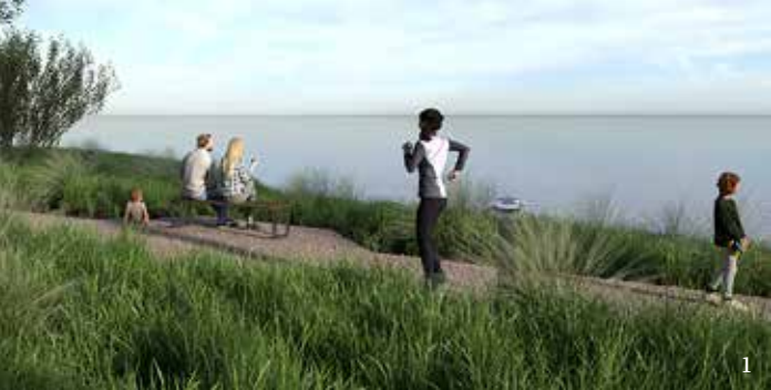
2026 Commonwealth Games: Lake Nagambie venue bid