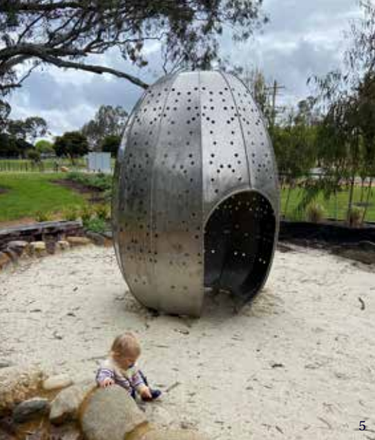
Cover image. Wangaratta Children’s Garden

A pre-election commitment to fund the $1.5 million design and delivery of a Nature Based Play Space for Euroa.