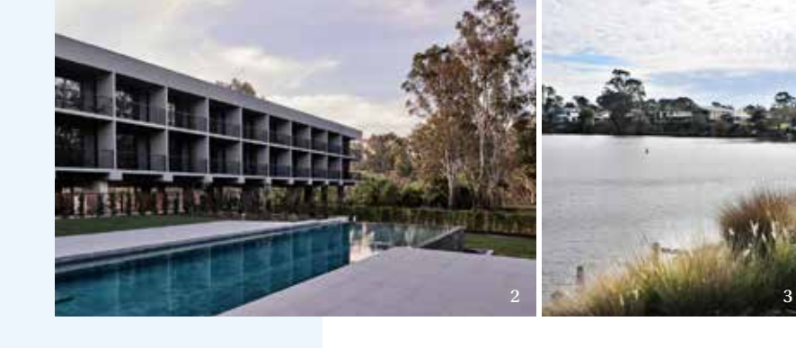
2026 Commonwealth Games: Lake Nagambie Rowing venue bid

Currently, Strathbogie Shire Council together with the Victorian Government and Australian Government are delivering a $3.8 million foreshore walk project which will provide valuable connectivity and lakeside access along the rowing course to benefit coaches, spectators and visitors alike; providing a number of viewing sites along the water bank.