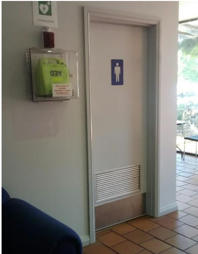
Inside the boys toilets