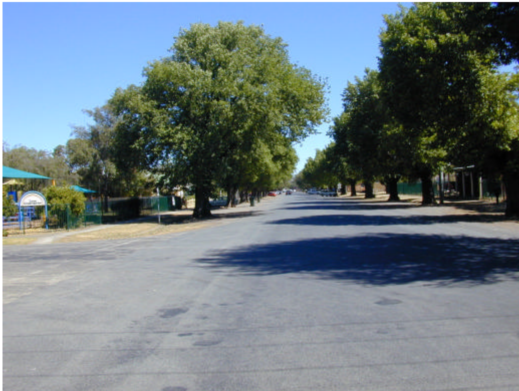
Avenue of Elm Trees – Kirkland Avenue West, Euroa