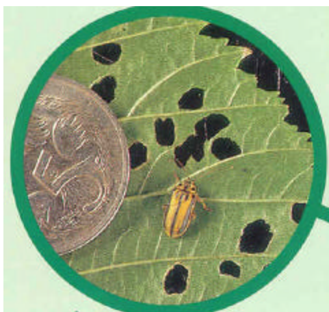
The Elm Leaf Beetle

Comparisons of elm trees infested with ELB that are treated with the spray program, compared to those elms that are not treated indicated the program has been very successful. Trees infested that have received no control measures are virtually defoliated, distressed and extremely unattractive.