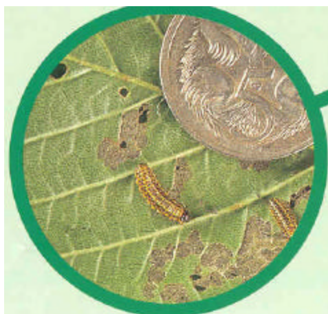
The larvae stage