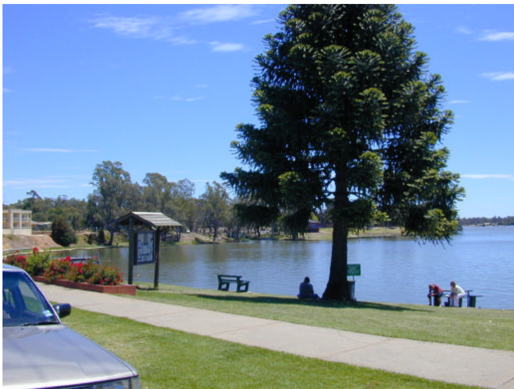
Bunya Bunya tree – Jacobsens Outlook, Nagambie

This management plan outlines the Strathbogie Shire Council's approach to the total management of its urban tree asset.