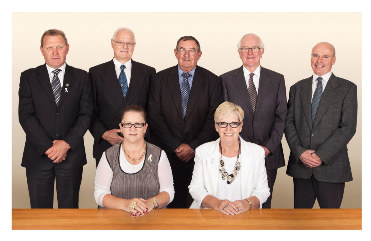
(Strathbogie Shire Councillors)

A Shire that builds trust and recognises community needs through transparent, accountable and democratic decision making (Governance).