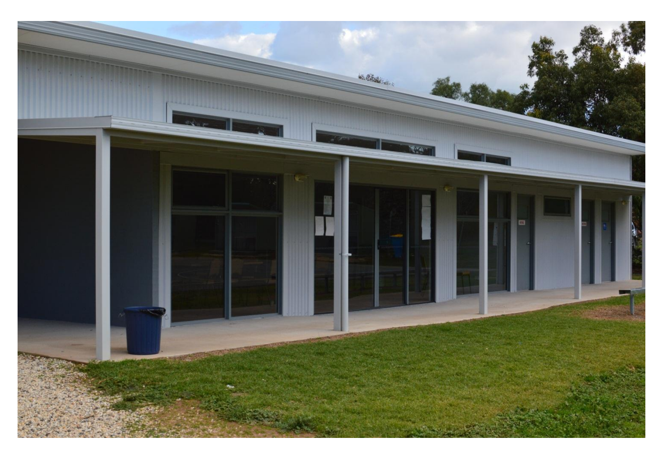
(Avenel Recreation Reserve)

To promote and foster sustainable development in our natural and built environment (Environment).