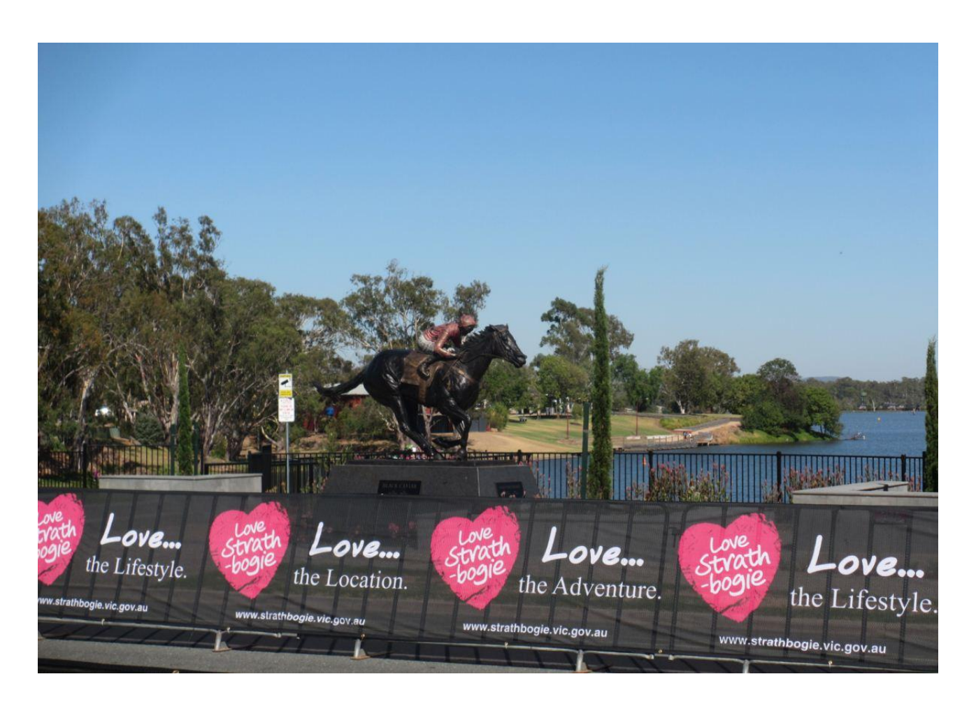
2013 – 2017 Strathbogie Shire Council Plan