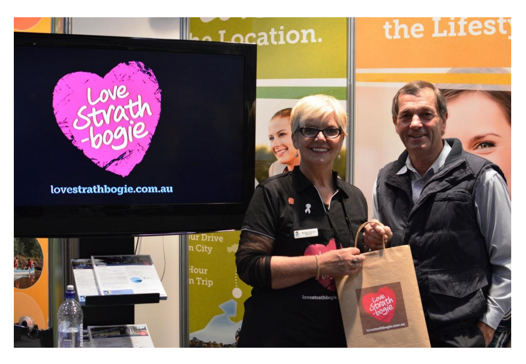
(Regional Living Expo 2013)

A desirable and safe destination that supports the development of tourism and hospitality enterprises that drive economic growth across our Shire (Tourism and Hospitality).