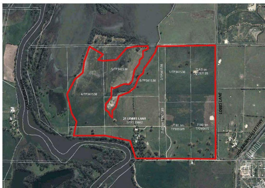
Figure 1 – Subject Site and existing title boundaries

The site is approximately 150 hectares with frontages to Lobbs Lane and the unsealed continuation of Racecourse Road. The northern boundary consists of the continuation of Coes Road (unmade) and Lake Nagambie which also continues along the western portion of the subject site. The Goulburn River includes a narrow backwater which penetrates the site from the north, creating an irregular site boundary which runs along the lake's periphery.