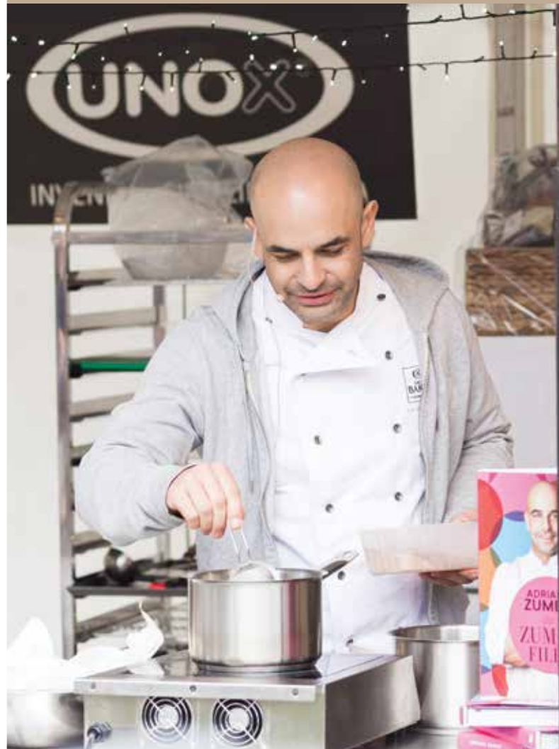
Adriano Zumbo at the Mitchelton Chocolate Festival

Up to 5000 people braved the wet weather for the inaugural Mitchelton Chocolate Festival in Nagambie.