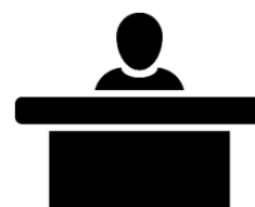
Come into Council