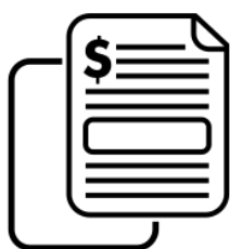
Invoice with BPAY option

The cost of an Annual Footpath Trading permit is $85 for a single item or $137 for multiple items (2019/20 fees).