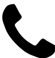
Over the phone