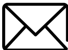
Email the form