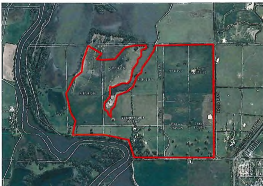
Figure 1 – Subject Site and existing title boundaries

The site is approximately 150 hectares with frontages to Lobbs Lane and the unsealed continuation of Racecourse Road. The northern boundary consists of the continuation of Coes Road (unmade) and Lake Nagambie which also continues along the western portion of the subject site. The Goulburn River includes a narrow backwater which penetrates the site from the north, creating an irregular site boundary which runs along the lake's periphery.