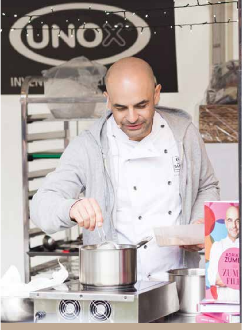
Adriano Zumbo at the Mitchelton Chocolate Festival

Up to 5000 people braved the wet weather for the inaugural Mitchelton Chocolate Festival in Nagambie.