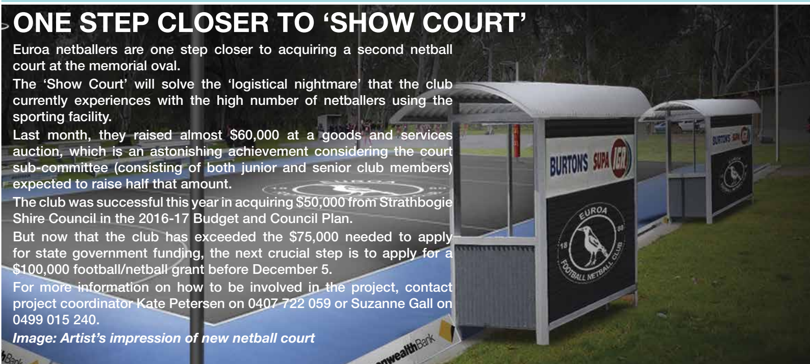
Image: Artist's impression of new netball court